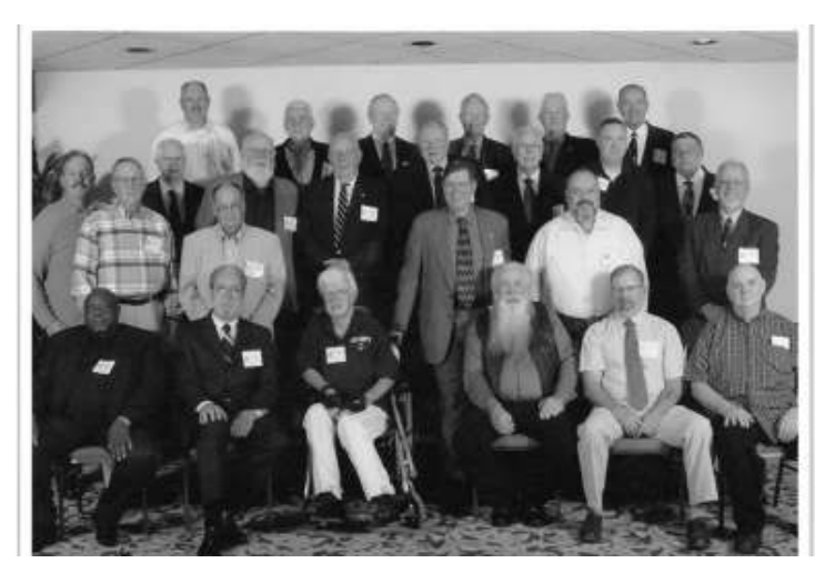
We rounded up the usual suspects....