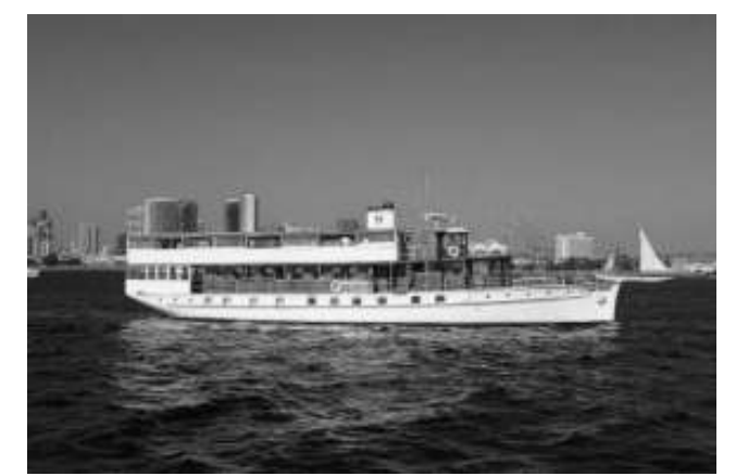
The good ship MV High Spirits in San Diego Harbor, sister ship of the USS Sequoia. It was a great night on the waters of San Diego Bay.

All of these pictures, and much more, can be seen in full, living color on our website at: