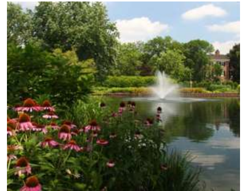
Cantigny Park, Oak Brook

about two miles north and south of the hotel. The cost one-way is about $3.80. And, the Holiday Inn will provide complimentary shuttle service throughout the day and evening to any location within a five mile radius including the various Metra stations (Chicago's version of Metro).