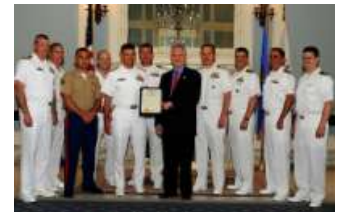
Oklahoma City 2009