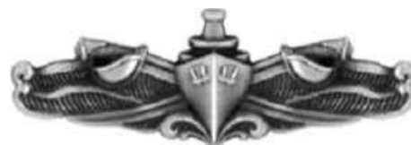
Enlisted Surface Warfare Specialist

Vietnam was a very intense war in a very small place on the globe that ultimately required all the resources the Navy could bring to bear over the next nine years. And, the nature of the war was different - lots of time sitting on station while the aviators provided wave after wave of support for the Army and Marines ashore - for nine long years.