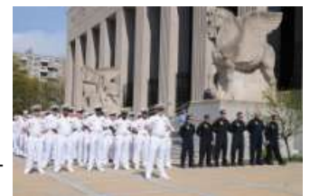
St. Louis 2009