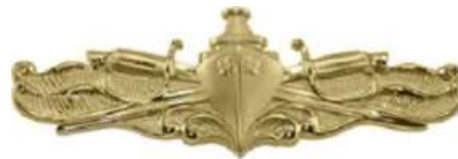
Surface Warfare Officer

Generally speaking, half the fleet units were veterans of World War II and Korea. The other half were newbie hulls with new engineering and combat systems that had never been tried in combat.