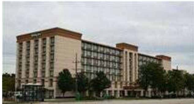
Holiday Inn Chicago Oak Brook

For the independent tourists, there are the Union Pacific and Burlington Northern Santa Fe commuter rail lines into the Chicago Loop with stations