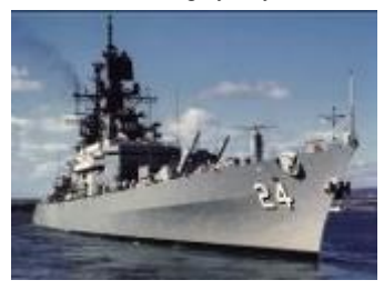
1975—Departing Pearl Harbor