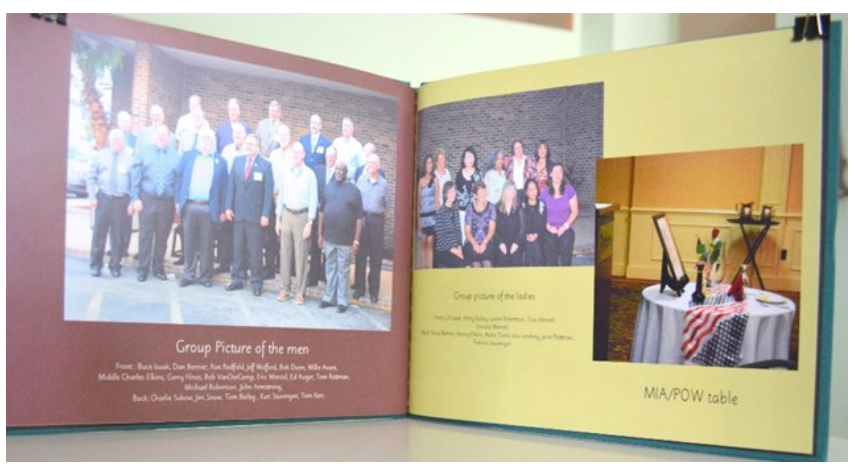
(Continued on page 9)