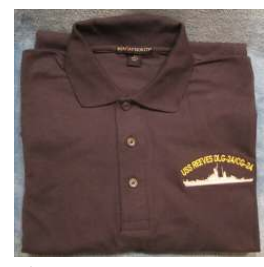
T-Shirts ($15) + s/h