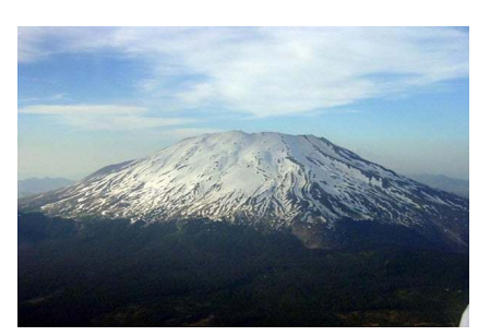
Mt. St. Helens north of Portland

These can include easy drive day trips to Mt. Hood and Mt. St. Helens. A trip to Mt. St. Helens could include visits to the observation platforms at the Forest Learning Center and the Johnson Ridge Observatory.