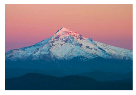
Mt. Hood east of Portland

We are going to set up a "tours" table in the hospitality room where those with and those without transportation can band together for their mutual tour destinations.