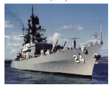
1975—Departing Pearl Harbor