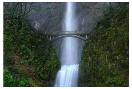
Multnomah Falls at the Columbia Gorge

So much to do, so few days to do it all!