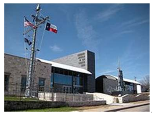
National Museum of the Pacific War.

Fredericksburg, Texas, appears to be typical of small-town America: quaint, familyowned shops and restaurants line Main Street. However, tucked behind a gift store, a German restaurant and other casual eateries stands the National Museum of the Pacific War.