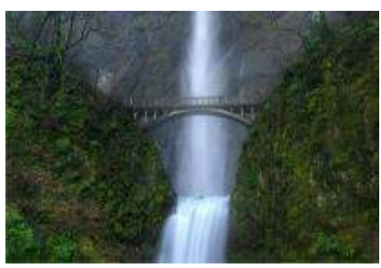
Multnomah Falls at the Columbia Gorge

Heeding the call of the "Women's Auxiliary" at the 2012 reunion, Portland is a perfect base for wine and vineyard tours west of Portland.