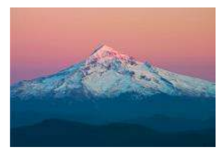
Mt. Hood east of Portland

Portland has been described as America's most European city. If that means a great walking city with tons of public transportation, a progressive atmosphere that celebrates the arts, a culture of great food, artisan coffee, beer and wine and neighborhoods chock full of shops selling handmade clothes, crafts and furniture, then we'd have to agree.