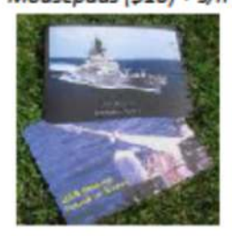
Mousepads ($10) + s/h