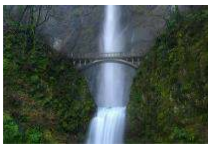
Multnomah Falls at the Columbia Gorge

Heeding the call of the "Women's Auxiliary" at the 2012 reunion, Portland is a perfect base for wine and vineyard tours west of Portland.