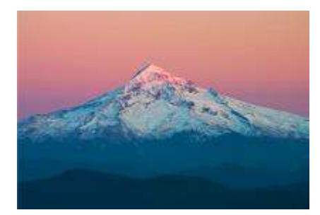
Mt. Hood east of Portland

Portland has been described as America's most European city. If that means a great walking city with tons of public transportation, a progressive atmosphere that celebrates the arts, a culture of great food, artisan coffee, beer and wine and neighborhoods chock full of shops selling handmade clothes, crafts and furniture, then we'd have to agree.