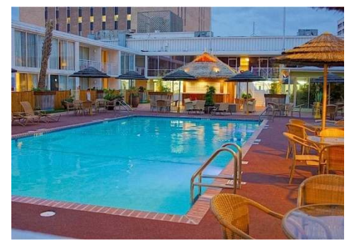
El Tropicano Pool

In a search of all of San Antonio venues, dealing with the CVB, and a conversation with HotelPlanners for the hotels alongside the River Walk and elsewhere in San Antonio in 2015, only one was able to accommodate us at a reasonable rate in the place we'd really like to be: El Tropicano River Walk Hotel.