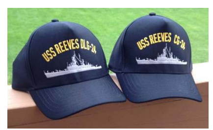
Price S/H Total Description Total Total Total