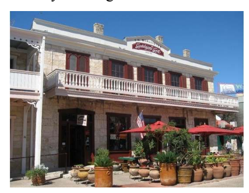
La Villita Restaurantsd

throughout the area. As done at past reunions, there will be a Welcome Reception in the Hospitality Room with hosted bar and heavy hors d'oeuvres on Friday evening.