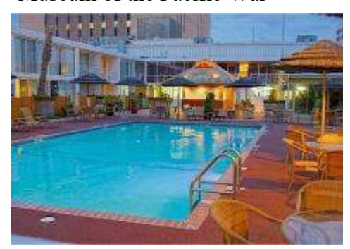
El Tropicano Pool

Since there is so much to do on the River Walk, and the nearby Downtown and Old Town (Mercado) areas, only one day trip is planned—to the National Museum of the Pacific War