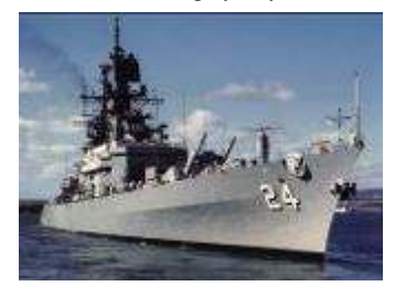
1975—Departing Pearl Harbor