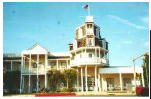
Admiral Nimitz Museum

As there are no plans for a dinner cruise, evenings are free to explore the many restaurants throughout the area. As done at past reunions, there will be a Welcome Reception in the Hospitality Room with a hosted bar and heavy hors d'oeuvres on Friday evening.